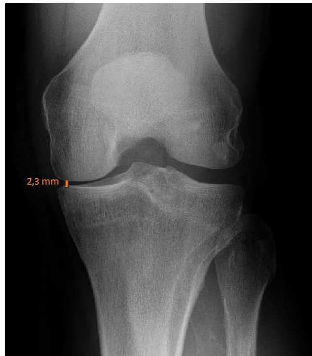
Fig. 1 Measurement of joint space width from weight-bearing Schuss-view radiographs

Data analysis was performed with R version 3.6.3. (The R foundation for Statistical Computing, c/o Department of Statistics and Mathematics, University of Vienna, Vienna, Austria). The Mann–Whitney U test was applied to test for significant differences between groups regarding the WOMAC